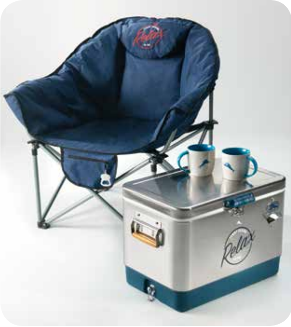
Tommy Bahama® accessory kit completes your beach-inspired experience.